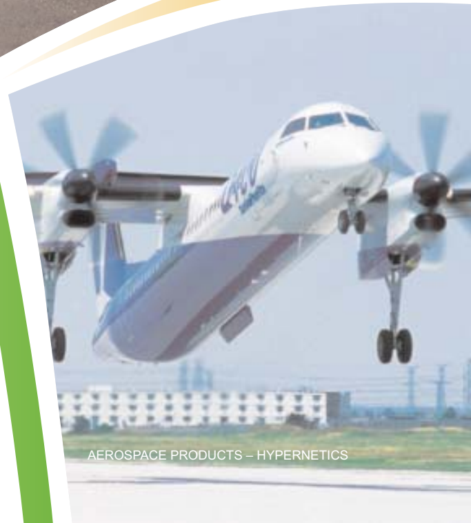
AEROSPACE PRODUCTS - HYPERNETICS

FOR THE THREE MONTHS ENDED JUNE 30, 2011 (UNAUDITED)