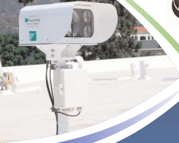
WAVEBRIDGE - PLAINTREE SYSTEMS