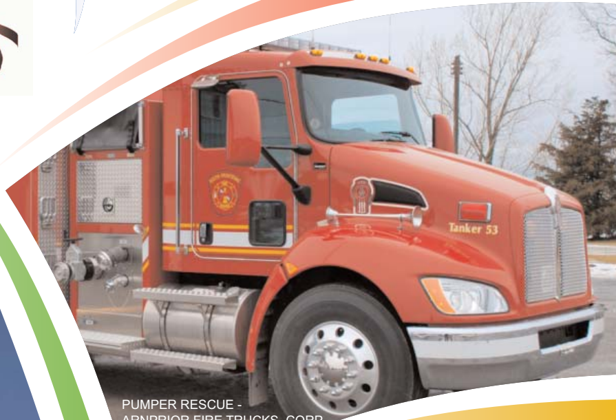
PUMPER RESCUE - ARNPRIOR FIRE TRUCKS. CORP